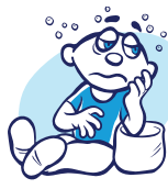
Weak or tired