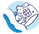
Nightmares or crying out during sleep

A blood glucose reading under _____mg/dL is too low for my child.