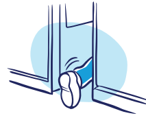
Needing to pass urine more than usual