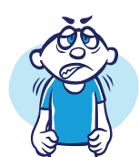
Nervous or upset