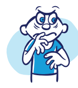
Irritability or impatience